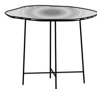
occasional table high version