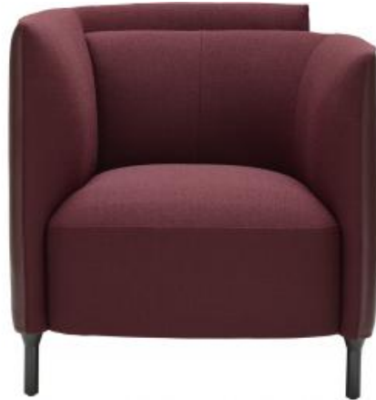
ARMCHAIR COMPLETE ITEM