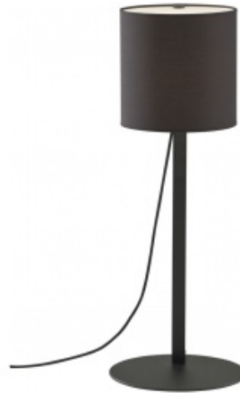
TABLE LAMP BLACK