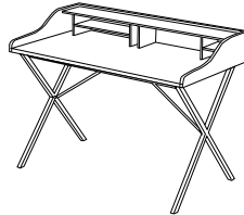
desk white lacquer