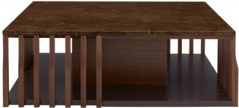
LOW TABLE DARK WALNUT VERDE MARBLE TOP

The lower space is free of any partitioning with only the central square consolidating the whole and supporting the weight of the heavy marble top (67 kg): this brings the table's overall weight to 121 kg, although it does not look as if it is that heavy. The central square is also finished in dark walnut veneer, with the lower top in contrasting chocolat lacquer. The low table is mounted on adjustable jacks which lift it 20 mm from the ground.